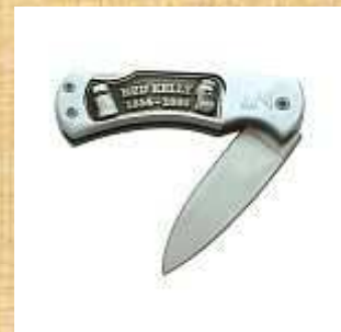
A Ned Kelly knife

http://www.ironoutlaw.j: x<WBHCZcom/ http://www.nedkellysworld.com.au/history/history.htm http://fr.wikipedia.org/wiki/Ned_Kelly http://en.wikipedia.org/wiki/Ned_Kelly_Awards http://dreamsis29.tripod.com/Stringybark.htm