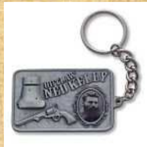
A Ned Kelly Key ring