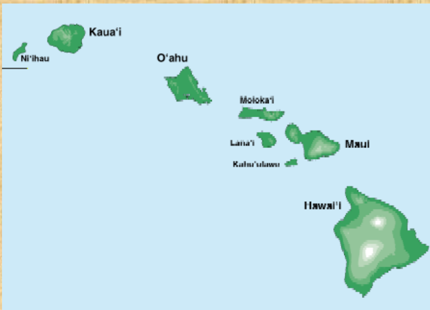
Map of the archipelago Hawai'i

Google image; James cook Wikipedia; James cook et les iles Sandwich