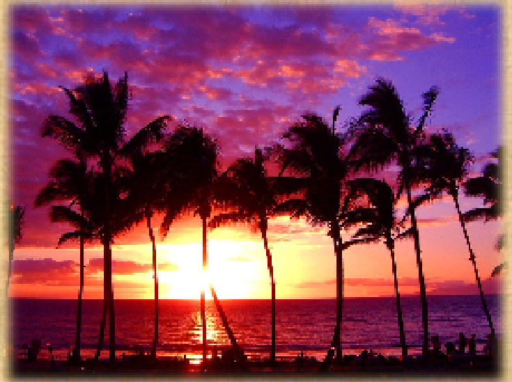
The Hawaiian sky

His life and his voyages must have been very interesting.