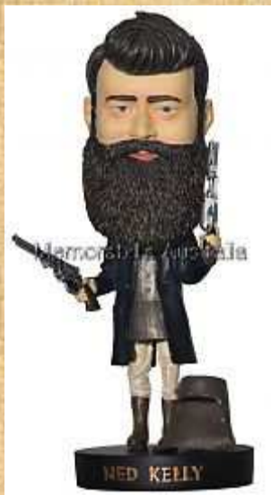
A Ned Kelly figurine

Ned Kelly is so popular that many merchandising products have been created.