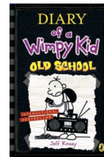
Diary of a Wimpy Kid, a novel by Jeff Kinney, 2015

Diary of a Wimpy Kid, Old School, Jeff Kinney, 2015