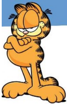
a cartoon by Jim Davis

Garfield is a fat orange cat. He loves eating (particularly lasagna!). He doesn't like Odie; the dog and he hates walking in the morning!