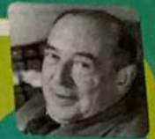
Name: C.S. Lewis (1898-1963) Nationality: Irish